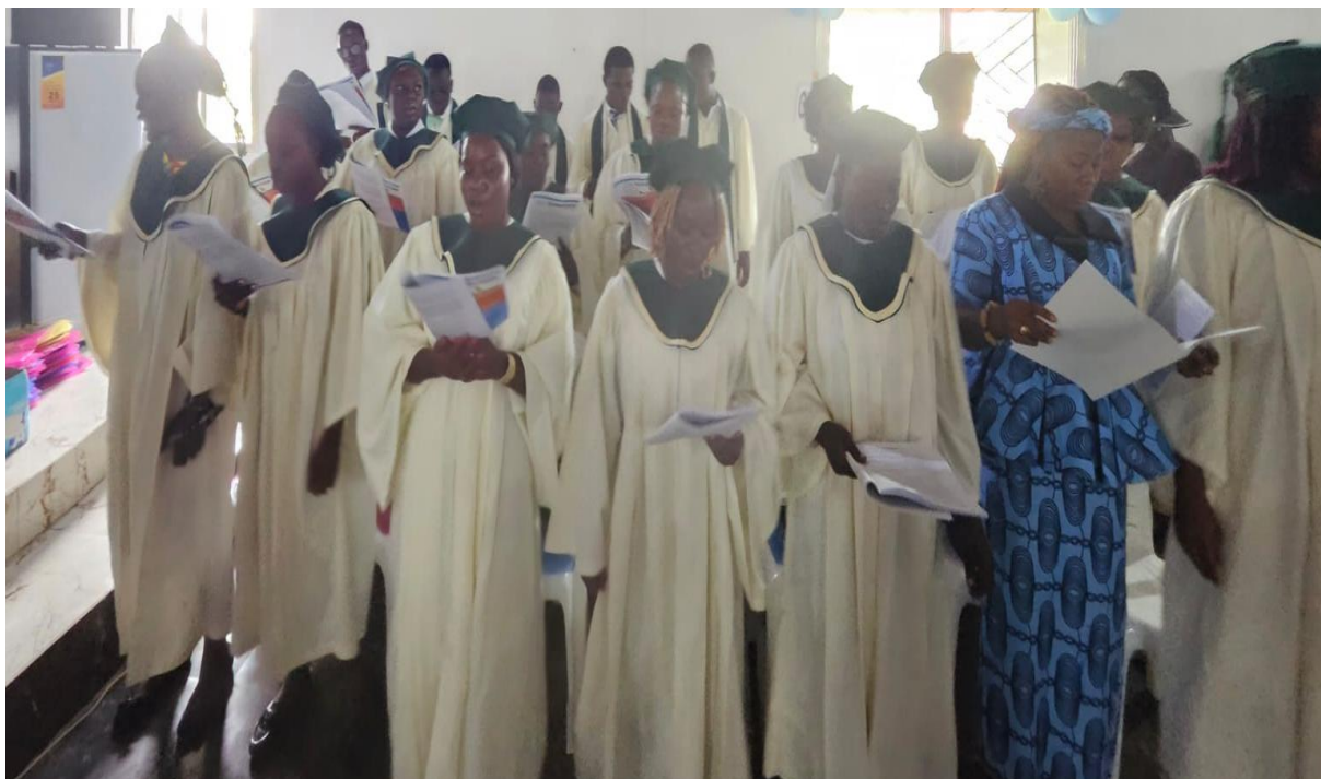
Ebenezer Global Methodist Church Choir-at the Convening Conference