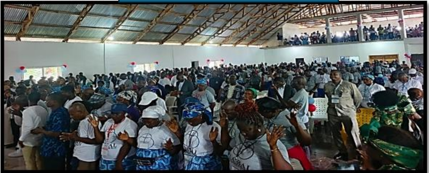
Delegates at the Convening Conference-Interceding for the growth of the church “if my people pray...I will Heal their land” (2 Chronicles 7:14)