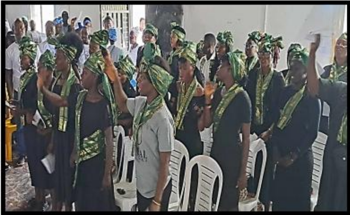
Mt. Nimba District Host Choir-at the Convening Conference